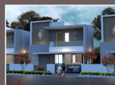
Mambakkam Villa Plots @ Vandalur Kelambakkam Main Road