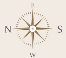
CAR PARKING PLAN