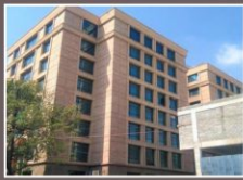
Nerkundram, Commercial Project