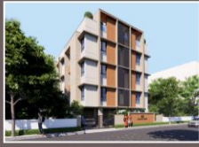
Anna Nagar - 13th Main Road