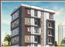
Perungudi, Ramapa Nagar