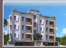
Anna Nagar - W Block Near Rountana