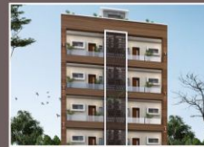
4th Avenue, Shanthi Colony, Anna Nagar