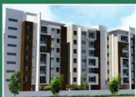
Nerkundram, Commercial Project