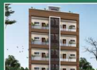
4th Avenue, Shanthi Colony Anna nagar