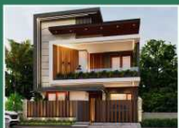
Anna Nagar - 13th Main Road