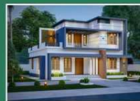
Perungudi, Ramapan Nagar