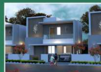
Mambakkam Villa Plots @ Vandalur Kelambakkam