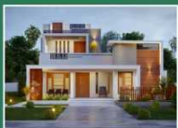
Anna Nagar - W Block Near Rountana